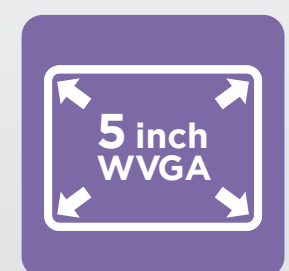
Touch optimized user interface and high resolution display